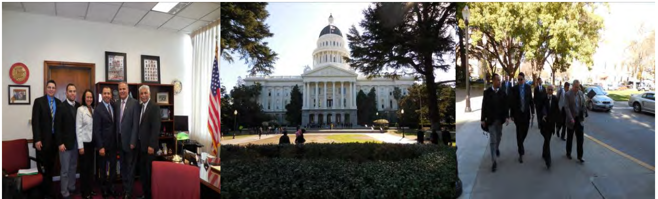
Photo below at the Capitol Rotunda with PECG Leadership assembled during the 2015 Legislative Day in Sacramento.

On March 3, 2015, PECG leaders representing every PECG section from across the state, including 9 officers from the LA Section traveled to Sacramento to meet with their state legislators at the state capitol. These meetings are held once a year and provide a forum and a unique opportunity to meet with elected state officials and have a direct conversation with representatives in both houses. Meetings were held all day from 9 am to 5 pm in small groups in a round-table format with PECG officers and with each elected official in 30 min sessions to discuss selected topics of representation.